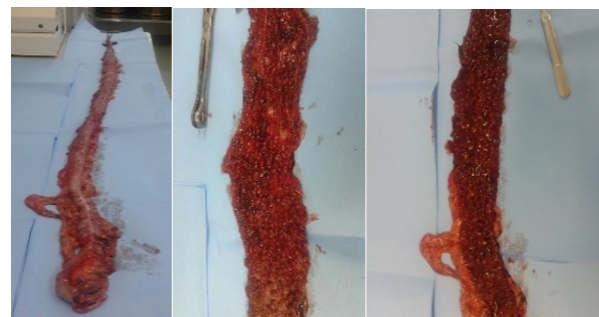
Figure 3. The large intestine has been completely removed. View of the preparation in its entirety and in the opened state. Sometimes the number of polyps in the intestinal tract exceeds fifty thousand.

The removed large intestine was sent for histological examination in all cases, the established diagnosis was fully confirmed (Figure 3).